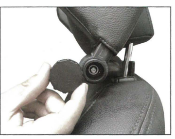
3.Install the left and right wings on both ends of the headrest bracket and tighten the plastic screw cap.